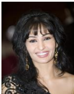
Rawah Yaseen, famous Syrian actress