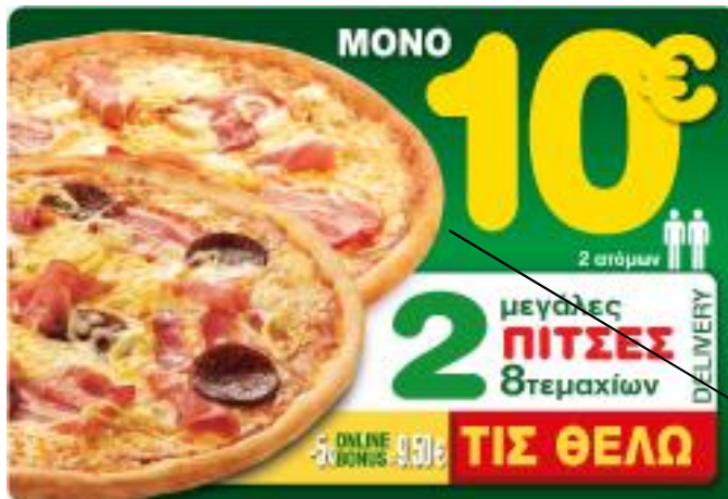
the (promotional) leaflet