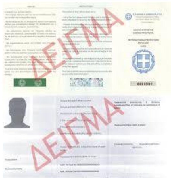
asylum seeker's card (valid for six months)